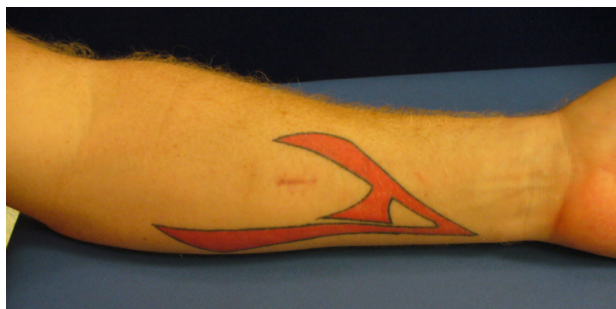
Figure 2: Left forearm with unobtrusive scar 6 weeks after surgery